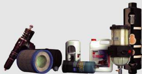
500 hours genset spare parts